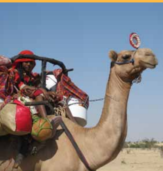
Young pastoralist woman in Niger on the move to green pastures at Lake Chad

Joto Afrika is Swahili; it can be loosely translated to mean 'Africa is feeling the heat'. Please tell us what you think about this special issue of Joto Afrika and what you would like to read about in future issues – contact details are on page 8 .