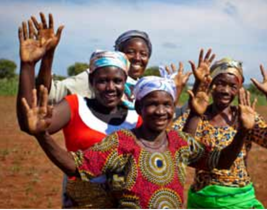
Women are resourceful agents of climate change